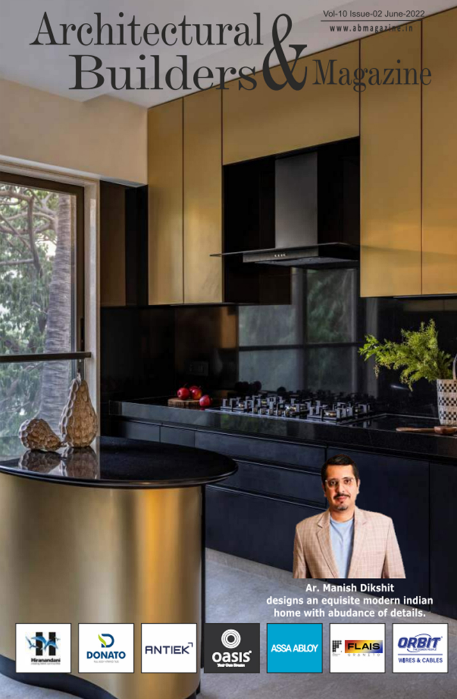
Ar. Manish Dikshit designs an exquisite modern Indian home with abundance of details.